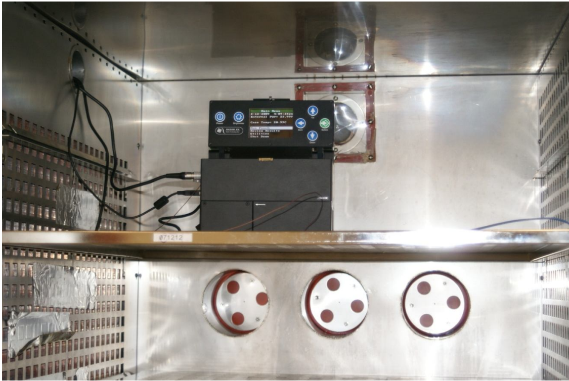
Photograph 1. Test Setup.