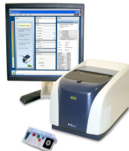
FilmArray Real-Time Instrument